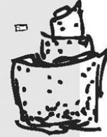
WAFERS JASMINE, BROWN SUGAR